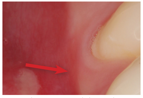
Canker Sore or "Aphthous Ulcer"

If the ulcer is the result of a disease process, it may worsen if left untreated. If it is caused by ongoing trauma, it may also worsen with time. In the rare event that it is cancer, it can lead to disfigurement or death if not diagnosed and treated in a timely manner.